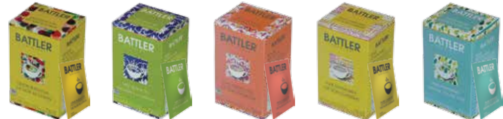
Lemon Black Tea 20 sachets 7325 Mint Black Tea 20 sachets 7625 Peach Black Tea 20 sachets 7525 Pure Chamomile 20 sachets 6125 Pure Peppermint 20 sachets 6225