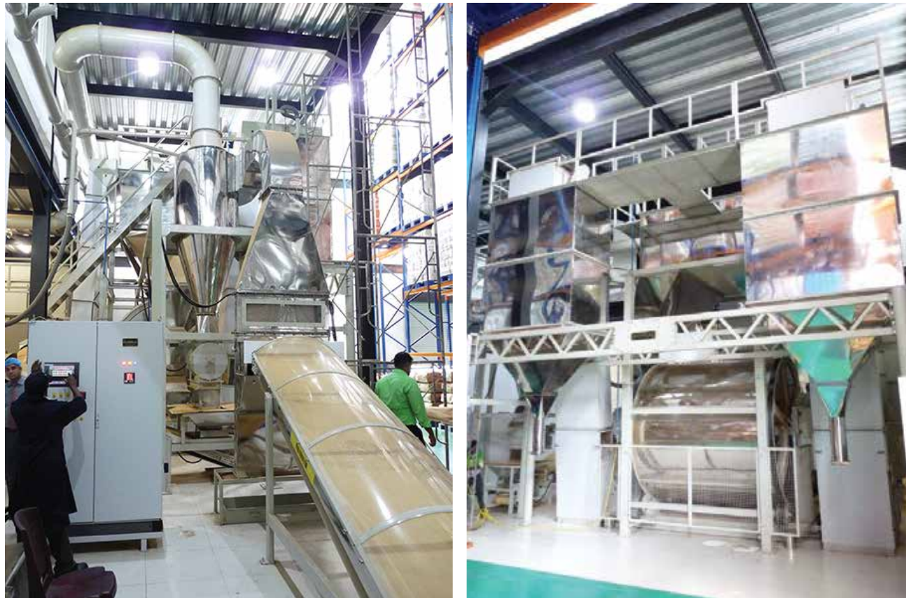
BULK TEA BLENDING