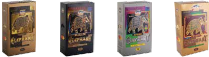
Gold Elephant Loose Leaf Tea 250 g 3302 Black Elephant Loose Leaf Tea 250 g 3202 Ruhunu Elephant Loose Leaf Tea 250 g 2112 Kandy Elephant Loose Leaf Tea 250 g 1112