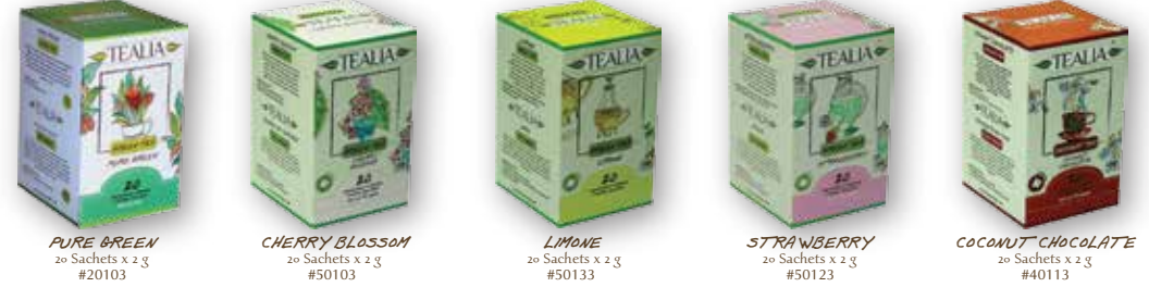
PURE GREEN 20 Sachets x 2 g #20103 CHERRY BLOSSOM 20 Sachets x 2 g #50103 LIMONE 20 Sachets x 2 g #50133 STRAWBERRY 20 Sachets x 2 g #50123 COCONUT CHOCOLATE 20 Sachets x 2 g #40113