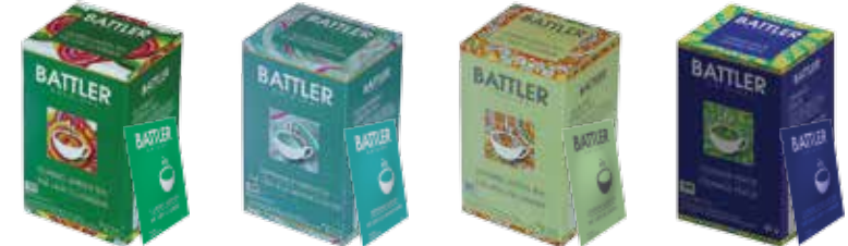
Classic Green Tea 20 sachets 7825 Peppermint Green Tea 20 sachets 6025 Jasmine Green Tea 20 sachets 7925 Orange Pekoe 20 sachets 6325