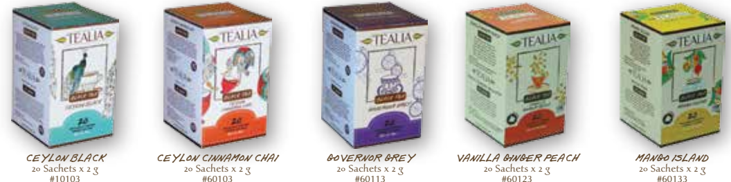
CEYLON BLACK 20 Sachets x 2 g #10103 CEYLON CINNAMON CHAI 20 Sachets x 2 g #60103 GOVERNOR GREY 20 Sachets x 2 g #60113 VANILLA BINDER PEACH 20 Sachets x 2 g #60123 MANGO ISLAND 20 Sachets x 2 g #60133