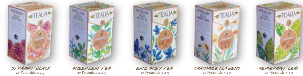
STRAIGHT BLACK 20 Pyramids x 2 g #80100 GREEN LEAF TEA 20 Pyramids x 2 g #80105 EARL GREY TEA 20 Pyramids x 2 g #80110 CHAMOMILE FLOWERS 20 Pyramids x 2 g #80115 PEPPERMINT LEAF 20 Pyramids x 2 g #80120