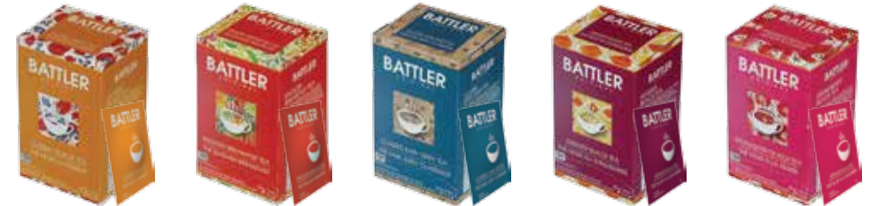
Classic Black Tea 20 sachets 7025 English Breakfast Tea 20 sachets 7125 Classic Earl Grey Tea 20 sachets 7225 Ginger Black Tea 20 sachets 7725 Strawberry Black Tea 20 sachets 7425