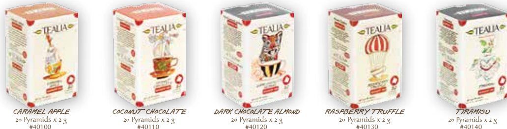
CARAMEL APPLE 20 Pyramids x 2 g #40100 COCONUT CHOCOLATE 20 Pyramids x 2 g #40110 DARK CHOCOLATE ALMOND 20 Pyramids x 2 g #40120 RASPBERRY TRUFFLE 20 Pyramids x 2 g #40130 TIRAMISU 20 Pyramids x 2 g #40140