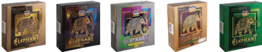
Gold Elephant 100 Tea Bags 3375 Black Elephant 100 Tea Bags 3275 Ruhunu Elephant 100 Tea Bags 2175 Kandy Elephant 100 Tea Bags 1175 Green Elephant 100 Tea Bags 3175