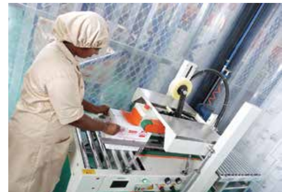
DOUBLE CHAMBER TEA BAGGING