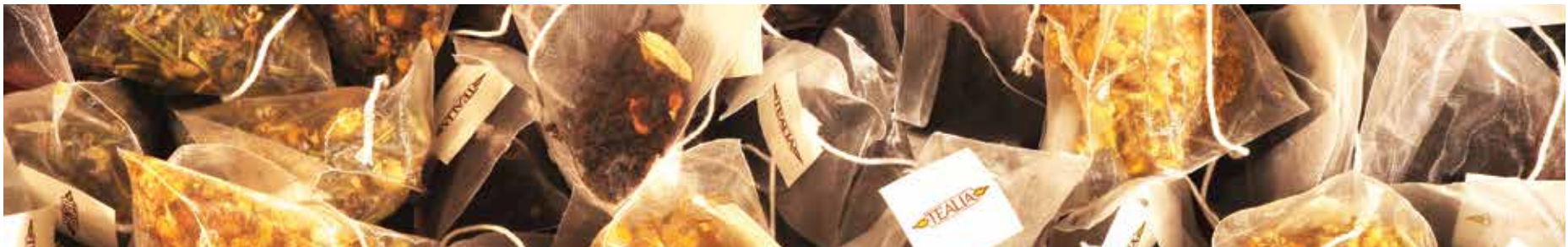
PYRAMID TEA BAGGING