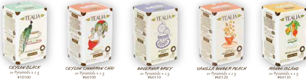
CEYLON BLACK 20 Pyramids x 2 g #10100 CEYLON CINNAMON CHAI 20 Pyramids x 2 g #60100 GOVERNOR GREY 20 Pyramids x 2 g #60110 VANILLA BINDER PEACH 20 Pyramids x 2 g #60120 MANGO ISLAND 20 Pyramids x 2 g #60130