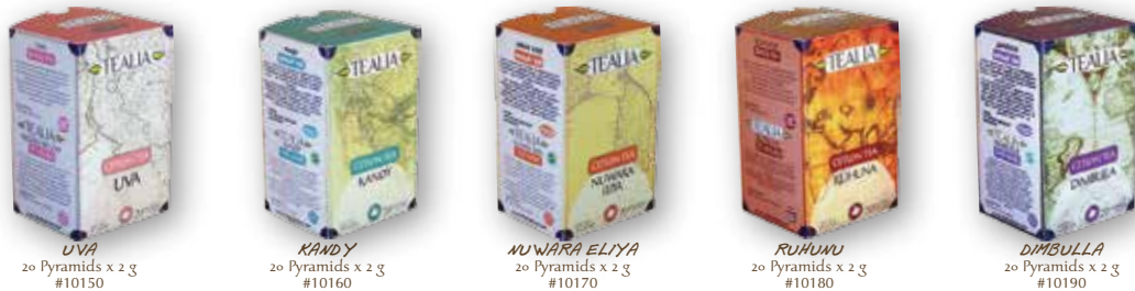
UVA 20 Pyramids x 2 g #10150 KANDY 20 Pyramids x 2 g #10160 NUWARA ELIYA 20 Pyramids x 2 g #10170 RUVUNU 20 Pyramids x 2 g #10180 DIMBULLA 20 Pyramids x 2 g #10190