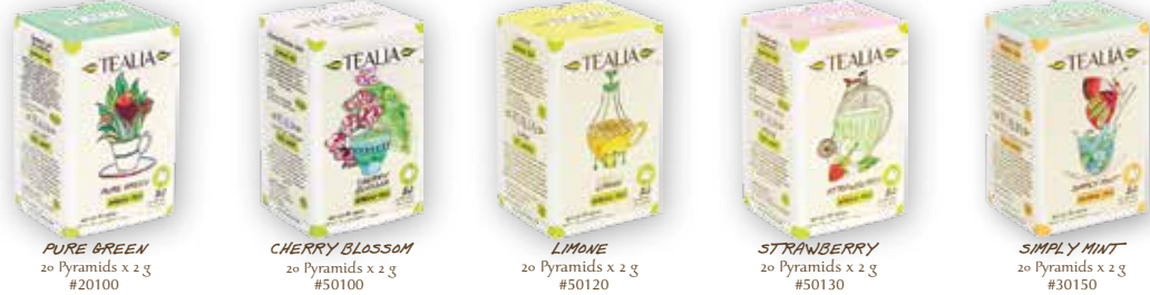
PURE GREEN 20 Pyramids x 2 g #20100 CHERRY BLOSSOM 20 Pyramids x 2 g #50100 LIMONE 20 Pyramids x 2 g #50120 STRAWBERRY 20 Pyramids x 2 g #50130 SIMPLY MINT 20 Pyramids x 2 g #30150