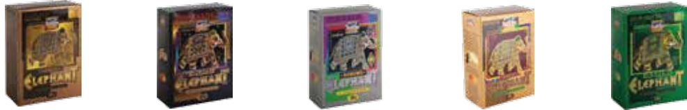
Gold Elephant Loose Leaf Tea 100g 3302 Black Elephant Loose Leaf Tea 100g 3202 Ruhunu Elephant Loose Leaf Tea 100g 2112 Kandy Elephant Loose Leaf Tea 100g 1112 Green Elephant Loose Leaf Tea 100g 3112