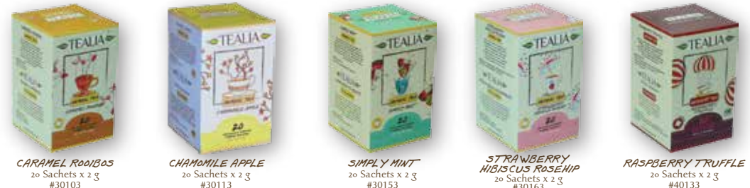
CARAMEL ROOIBOS 20 Sachets x 2 g #30103 CHAMOMILE APPLE 20 Sachets x 2 g #30113 SIMPLY MINT 20 Sachets x 2 g #30153 STRAWBERRY HIBISCUS ROSEHIP 20 Sachets x 2 g #30163 RASPBERRY TRUFFLE 20 Sachets x 2 g #40133