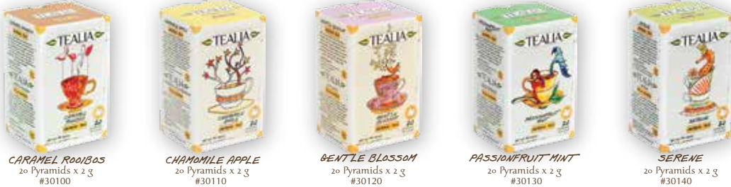
CARAMEL ROOIBOS 20 Pyramids x 2 g #30100 CHAMOMILE APPLE 20 Pyramids x 2 g #30110 BENTLE BLOSSOM 20 Pyramids x 2 g #30120 PASSIONFRUIT MINT 20 Pyramids x 2 g #30130 SERENE 20 Pyramids x 2 g #30140