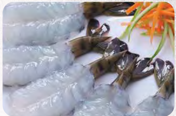
Raw Butterfly Shrimp