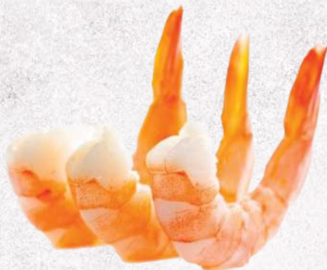
Cooked PD Tail-On Shrimp