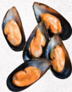
Half Shell Mussels