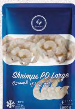
Shrimps PD Large