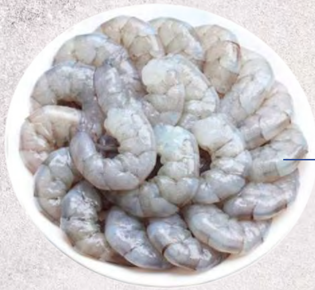
Peeled Deveined Shrimp