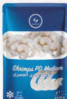
Shrimps PD Medium