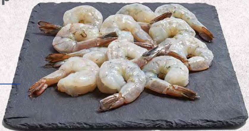
Peeled Deveined Tail-On Shrimp

8/12 | 13/15 | 16/20 | 21/25 | 26/30 | 31/40 | 41/50