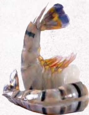
Raw Easy Peel Shrimp