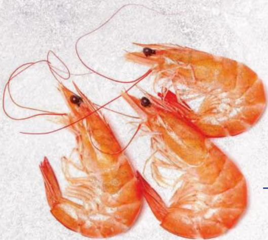
Cooked Head-On Shell-On Vannamei Shrimp