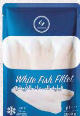
White Fish Fillet