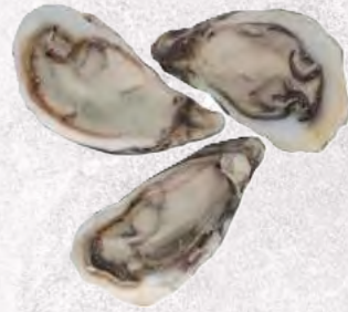
Oyster with Shell