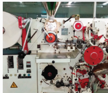
H&S PT | String and Tag Tea Bags Annual Capacity: 43 million bags.