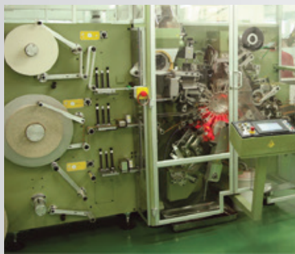
IMA C27 | Foil Envelope Tea Bags Annual Capacity: 72 million bags.