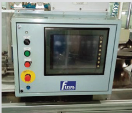
FUSO | Pyramid TB with auto foil bags wrapper Annual Capacity: 17 million bags.