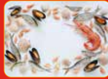
Seafood Products منتجات المأكولات البحرية