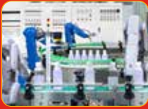
Food Technology & Machinery معدات و تكنولوجيا الأغذية