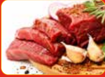
Meat, Poultry & Game اللحوم والدواجن