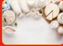
Dairy منتجات الألبان