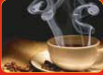
Drinks & Beverages