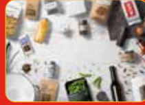
Canned & Preserved المعلبات والأغذية المحفوظة