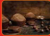
Sweets, Snacks & Bakery الحلوى والوجبات الخفيفة والمعجنات