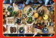
Food Services خدمات الأغذية