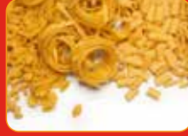
Grains & Cereals البذور والحبوب