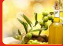
Specialty Products المنتجات المتخصصة