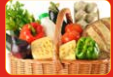
Chilled, Fresh & Frozen الأغذية الطازجة والمبردة والمجمدة